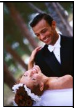
Spins & Dips!

8 Private Lessons + Wedding Dance Dress Rehearsal at a Practice Party! $ 545