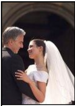
Father-Daughter / Mother-Son Dance

Give yourselves enough time for your dancing to become natural & comfortable and not look stiff and awkward. Allow at least four to six months of lessons so you'll feel poised and confident in front of your friends and family as you dance an elegant first dance as husband and wife!